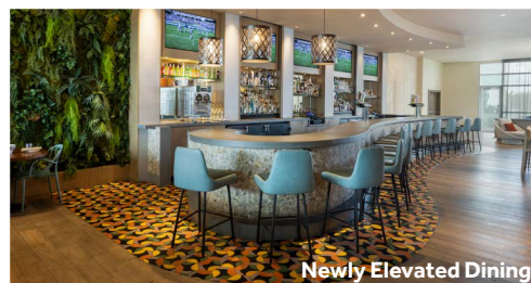
Newly Elevated Dining

For every $10,000 in guaranteed group revenue, receive $1,000 credit toward hotel branding.