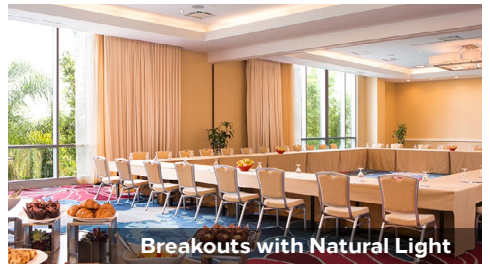
Breakouts with Natural Light

When you book your 2023 meeting you'll earn 2X Hilton Honors Bonus Points per $1 USD spent on eligible new events. Use these points toward future events, free nights, amazon purchases, and more.