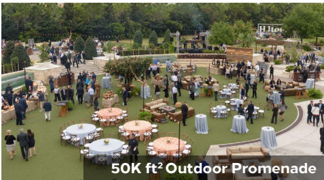
50K ft 2 Outdoor Promenade

We know event professionals move through life on the double—which is why we think your Hilton Honors Bonus Points should be too.